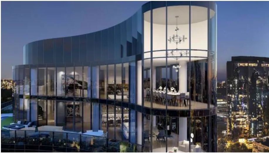
The penthouse has already caught the eye of “high-profile Melbourne business people”.