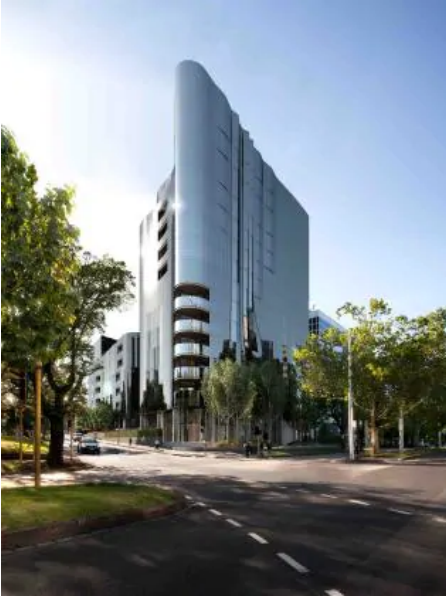
The apartment tower will occupy the corner of St Kilda and Toorak Rds.

Construction is due to start in January and be completed by mid-2021.