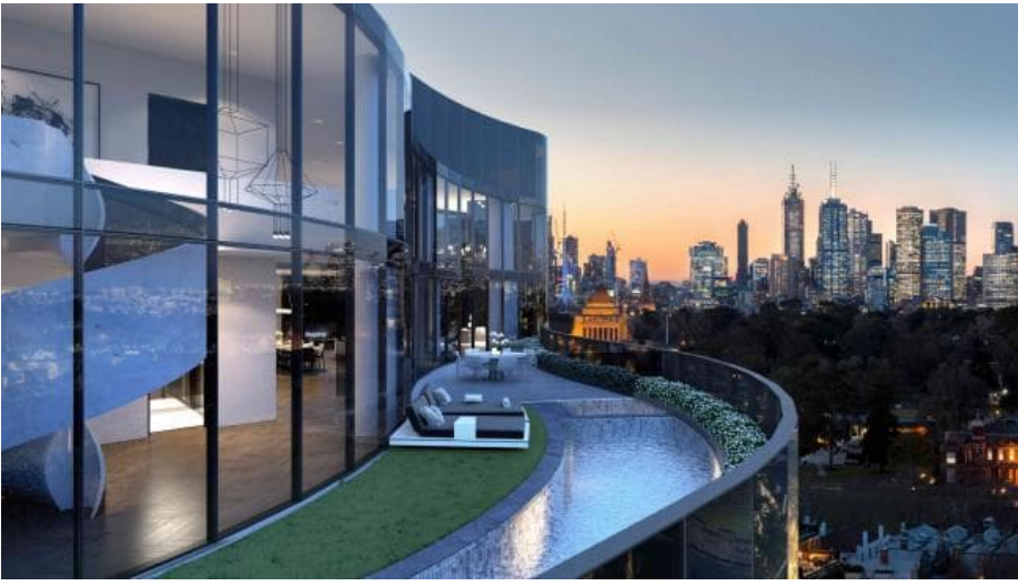
The penthouse will boast a pool, and this view.

Plans for The Muse penthouse by Bruce Henderson Architects feature four bedrooms, including an elaborate main suite with a dressing room, four bathrooms, a home theatre, billiard room, gym, steam room and study across 1001sq m of internal space.