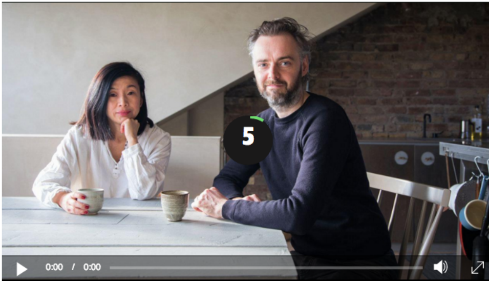
A London Apartment With Skyline Views