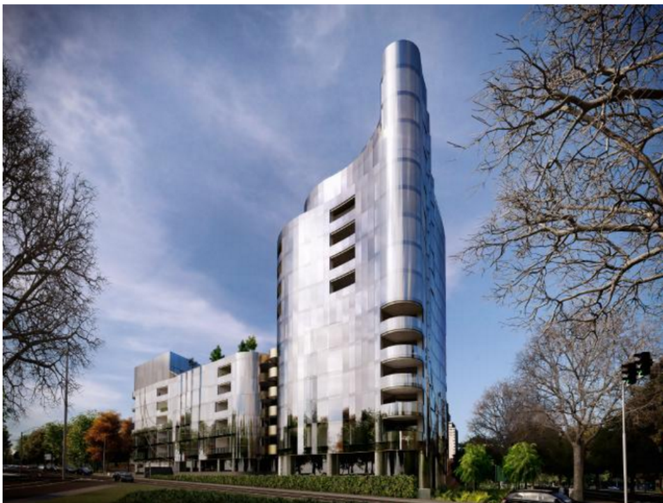
An artist's impression of The Muse high-end apartment development on St Kilda Rd.

The apartments will have three-metre ceilings and range in size from about 200sq m to more than 1000sq m for the penthouse.